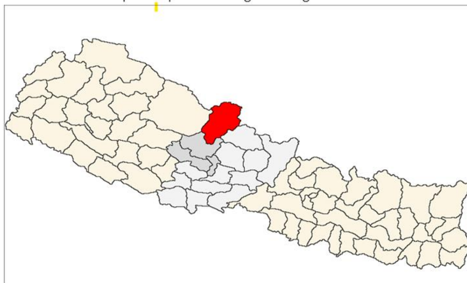
Map of Nepal indicating Mustang district

Mustang District, located in Gandaki Province, is one of its eleven districts, covering an area of 3,573 km 2 . As of the 2011 census, it had a population of 13,452, making it the second least populated district in Nepal. This remote district lies between Manag to the east, Nepal's least populated district, and Dolpa to the west, which ranks third in terms of sparse population density. The region experiences an average annual rainfall of less than 260 mm, particularly in Jomsom, which is located in Lower Mustang, due to its position in the rain shadow region of the Himalayas. While spring and autumn remain predominantly dry, the summer monsoon brings some rainfall, averaging 133 mm annually between 1973 and 2000. Mustang's climate exhibits significant temperature variations, with mean minimum monthly temperatures decreasing to -2.7°C in winter and maximum temperatures reaching 23.1°C during summer. Both diurnal (day–night) and annual temperature fluctuations are substantial, highlighting its arid and extreme climate.