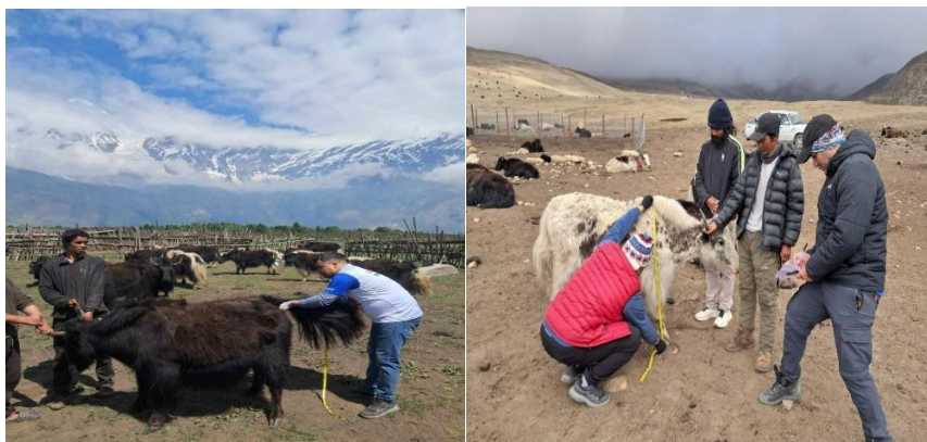
Fig. 2. Measurement of tail length and wither height at upper Mustang (Lomanthang-5)

Data was collected through Yak farm visits and interactions with yak owners and Yak caretakers using a structured and modified questionnaire. The sampling sites were selected from native yak habitats, and a total of 34 yaks from two locations, one in upper Mustang (Lomanthang rural municipality ward no. 5) and in lower Mustang (Thasang rural municipality, Nupsang), were assessed for various linear body measurements. The yaks sampled were adult yaks, exhibiting black, white, or mixed coat colors. Morphometric traits, including body length (from the point of the shoulder to the point of pin bone), heart girth, wither height, head length, horn length, and tail length, were measured via a measuring tape. All morphometric data were recorded in centimeters. These measurements provide valuable insights into the performance of yaks in the Mustang district. (fig 1).