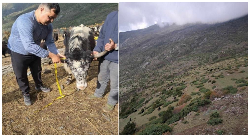
Fig 3. Measurement of ear length at Lower Mustang (Thasang-2)