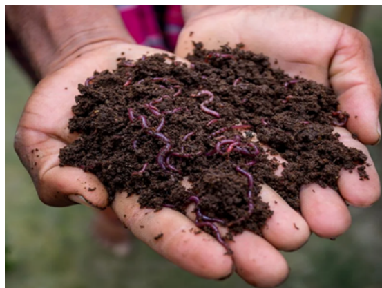
Figure 2 COMPOST ALONG WITH EARTHWORMS

Vermicomposting is a reforming process by which organic waste is broken down through the synergistic actions of earthworms and microbial communities. Vermicomposting has been shown to credibly reduce organic biomass and generate high-quality fertilizer for plants. Vermicomposting is a nutrient-rich organic enhancement generated from organic waste through the combined action of earthworms and microorganisms. The contributions of earthworms towards vermicomposting can be grouped into two phases: (i) an active phase characterized by the ingestion and processing of the organic wastes by earthworms and, (ii) a maturation-like phase in which microbes degrade the earthworm-processed materials.