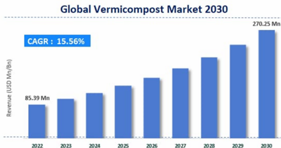
Figure 5 GRAPHICAL REPRESENTATION OF GLOBAL VERMICOMPOSTING

Teaching farmers, gardeners, and others about vermicomposting techniques and best practices vermicomposting can lead to significant benefits for individuals, communities, and the planet as a whole.