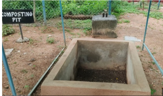
Figure 1 COMPOSTING PIT

Composting is a self-heating biological process [bioengineered,2022] in which breaking down of organic materials such as food scraps, yard waste and other biodegradable items into nutrient rich substance takes place to form a compost. This process occurs naturally through the action of microorganisms such as bacteria and fungi which decompose the organic matter over time. The product obtained through composting is used as soil fertilizer, apart from improving the soil quality it also helps in managing the waste produced through many activities, ultimately called as waste management. As, microbial action is very important in the whole composting process, according to various research conclusions there are certain conditions which Favour the growth of microbes, duration of composting process and quality of compost formed