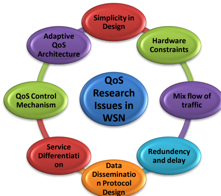
Figure 3 : Various Research Issues in WSN.

6.QoS Control Mechanism: In spite of centralized QoS control, a distributed QoS control mechanism is needed. Sensor nodes transmit excessive and bulk duplicate data or data with less importance to sink node. Some distributed mechanism or intelligence in sensor node network will ensure the required information is transmitted in network. Thereby, reducing burden on centralized control mechanism.