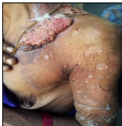
“Fig” 1 : annular plaque with keratotic border and atrophic centre with squamous cell carcinoma on chest and upper arm

She developed two ulcerated growths (cauliflower like as described by patient), one on the back of two years duration and the other on the chest of one year duration on previously existing lesion. Patient developed mild irritation and pain for which she took some symptomatic treatment. There is no similar complaint in the family. Cutaneous examination revealed a plaque of size 62×48 cms on the back extending up to the lower end of the rib cage on left side crossing the midline, in front extending on to the breast and left arm up to the elbow with central atrophy and well demarcated hyperkeratotic border with a groove in centre. Two ulcerated masses are present of size 12×6 cms on left side of chest and 14×10 cms in upper back . [“Fig.” 1,2]