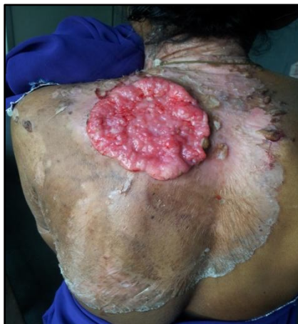
“Fig” 2: cauliflower like growth on the back on large atrophic plaque with hyperkeratotic border

Routine blood tests, X-ray chest and ultrasound abdomen were unremarkable. Elisa test for HIV was non reactive.