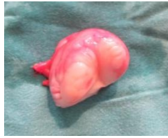
Fig.4: Gross appearance of the tumor after excision