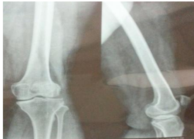
Fig.1: Radiograph of the Knee joint with thigh AP,Lat views