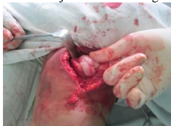
Fig.3: Gross intra operative appearance of the Tumor