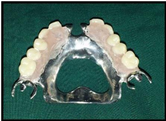
Fig 10: Final prosthesis