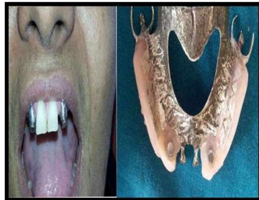
Fig 11: Pick up of magnet to denture