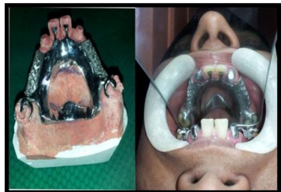
Fig 7: Metal frame work and try in.