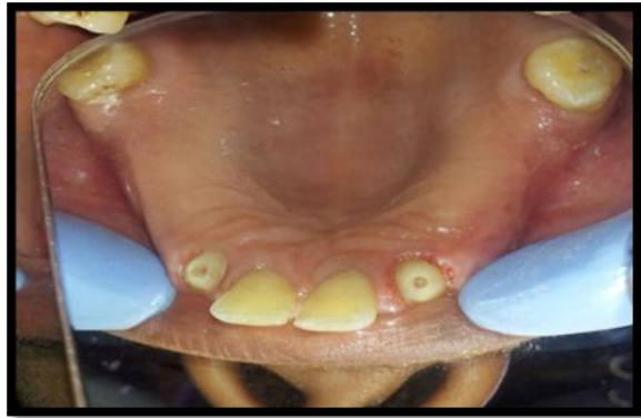
Fig 3: Preparation of post space.