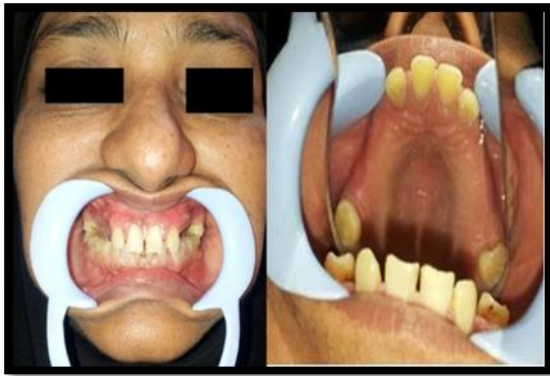
Fig 2: Partially edentulous maxillary arch.