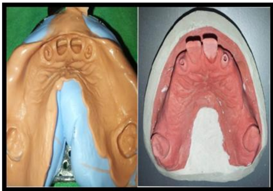
Fig 4: Post space impression and definite cast.