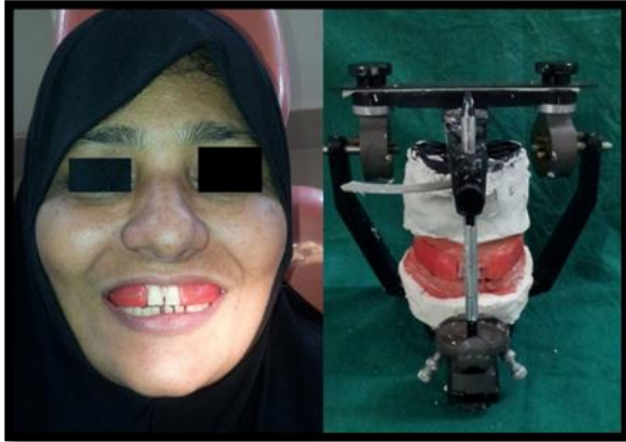
Fig 8: Jaw relation.