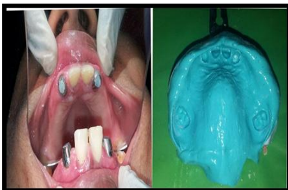
Fig 6: Metal coping with keeper and Final impression.