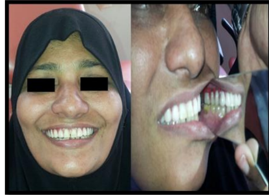
Fig 9: Try in