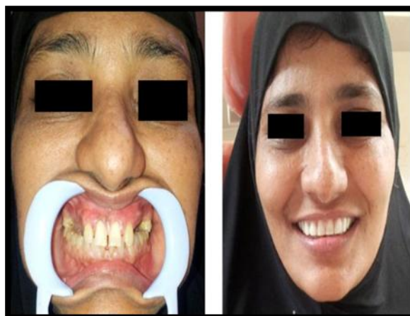
Fig 12: Pre and Post operative.