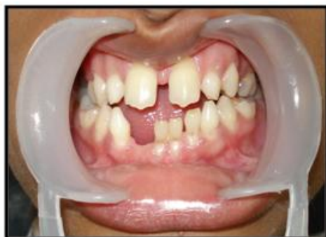
Fig 1: Intra oral view (Pre-operative)

Intra oral examination (Fig: 1) revealed the presence of ten retained deciduous teeth and only 14 permanent teeth (oligodontia). The retained deciduous canines were peg shaped. Wide midline diastema was evident. Maxillary and mandibular arches were poorly developed. Examination also revealed anterior open bite and bilateral posterior cross bite. All the teeth were not well aligned and there was no occlusion at all.