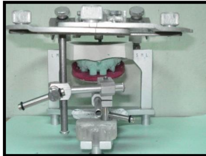
Fig 4: Face bow mounted on the whip-mix articulator.