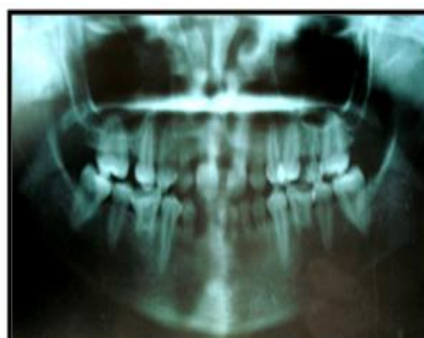
Fig 2: Pre-operative pantamogram.

Pre-operative radiograph (Fig: 2) shows the roots of the retained deciduous were resorbed which is not suitable for providing support for fixed prosthesis. The retained deciduous mandibular second molars are rectangular in shape with wide pulp chamber and the bifurcation seen only few millimeters above the apex of the root which gives the appearance of a taurodont [8]. The radiograph also reveals congenital absence of permanent maxillary lateral incisors, canines, first molars and mandibular anteriors and first molars.