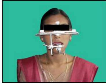
Fig 3: Face bow (quick mount) record in patient.