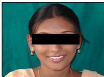
Fig 8: Rehabilitated patient