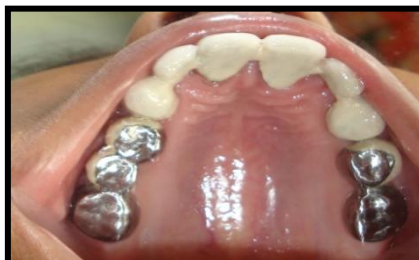
Fig 6: Metal-ceramic retoration cemented in maxillary arch.