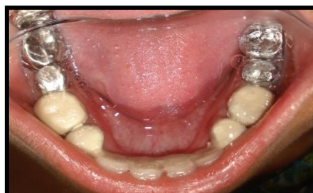
Fig 7: Metal-ceramic retoration cemented in mandibular arch