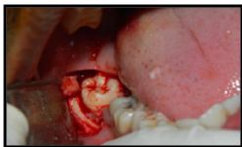
Fig. 3: Flap raised to visualize 48