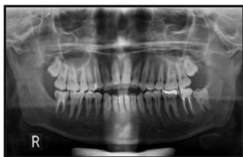
Fig. 9: Follow-up OPG