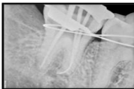
Fig. 7(b): Master cone radiograph