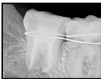
Fig. 8: Post-obturation radiograph