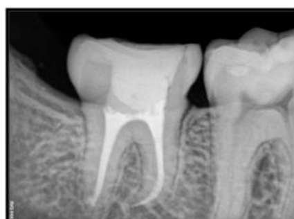
Fig. 10: 6 month follow-up radiograph