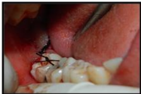
Fig. 5: soft tissues approximated and stutured