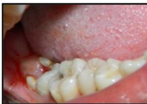
Fig. 1: Pre-operative photograph

Clinical and radiographic follow-ups were conducted at 3, 6 (Fig. 9, 10) and 12 months after autotransplantation and demonstrated successful treatment. At the end of 1 year, bone growth around the transplanted tooth was considered satisfactory (Fig 11).