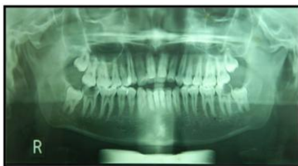
Fig. 2: Pre-operative Panoramic view