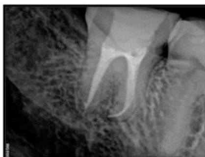
Fig. 11: Radiograph taken 1-year after treatment indicating a successful outcome.