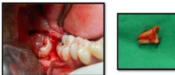
Fig. 4: Atraumatic extraction of 47