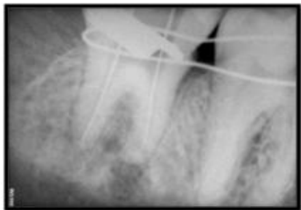
Fig. 7(a): working length determination