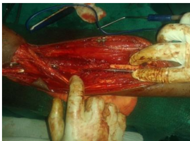
Figure 8. Free Fibula, hand bones and radius stabilized by DCP plates.

Specimen was sent for HPE and it was reported as bundles and whorls of spindle shaped cells with mild to moderate atypia with mitotic activity, collagenous bundles in between the cells. There was evidence of bony destruction. The resected margin of the bone was free of tumour. Immunohistochemistry marker S-100 was negative, but VIMENTIN was strongly positive. With the above picture it was reported as low grade fibrosarcoma.