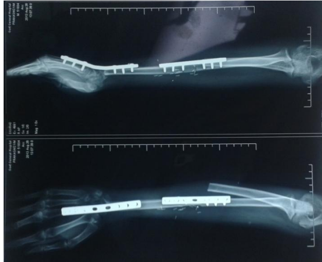
Figure 9. Post-operative X ray of left forearm.