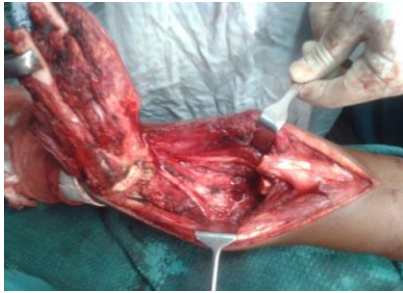
Figure 4. Excision of the tumour and both bones along with wrist disarticulation.

Slide was reviewed And It Was Confirmed As Fibromatosis. Patient Was Planned For An Monoblock Excision Of The Tumour With A Free Flow through Fibular Osteomyocutaneous Flap With Plate Screw Fixation And Wrist Arthrodesis By A Multidisciplinary Team Management.