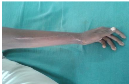
Figure 10. 15 th day Post-operative Surgical site.

As the postsurgical HPE reported as Fibrosarcoma Grade-I, patient was subjected to adjuvant radiotherapy (EBRT) .