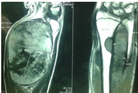
Figure 3. MRI of Left forearm.

MRI of the left forearm revealed a well defined heterogenous parosteal soft tissue mass in the left