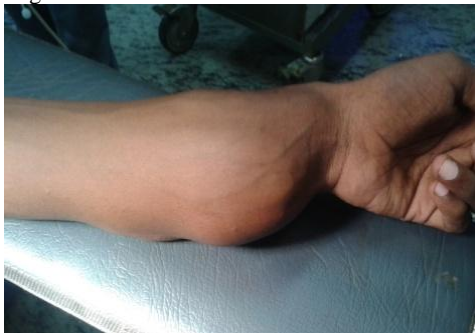
Figure 1. Pre-operative photograph of the left forearm tumor.

On clinical examination patient had a swelling noted at the distal one –third of volar aspect of left forearm. It measured about 9*7*6 cm. The surface of the tumour was found to be irregular with a longitudinal scar at the lateral aspect. The mass extended 15 cm from the elbow joint and 1cm from the wrist joint. The swelling was tender. Skin was free at all areas except at the site of the scar area. The swelling had well defined borders. The consistency was variable; it was firm to hard in certain areas. Mobility of the swelling was restricted. There was no distal neurovascular deficit. There was restriction of supination and pronation of left forearm; Rest of the movements of the both upper limbs were normal. There was no associated weakness of the left upper limb. There were no regional lymph nodes made out clinically. The differential diagnosis made was soft tissue sarcoma and Bone tumor and the case was evaluated.