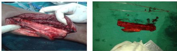
Figure 6. Harvesting Right fibular free flap.