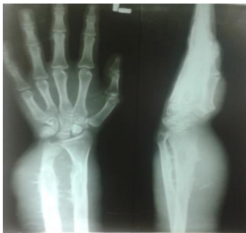
Figure 2. X ray of left forearm - AP & Lateral view.

X ray forearm showed soft tissue mass in the distal forearm associated with multiple focal erosions of ulna and radius.