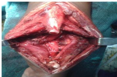
Figure 5. Soft tissue bed with neurovascular structures after tumor excision.