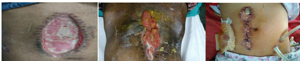
FIG- Showing postoperative complication

Postoperative complications increase patient morbidity and mortality and are a target for quality improvement programs. Many complications may be prevented by thorough preoperative evaluation, sound surgical technique and careful follow-up care. The emergency laparotomies are also more common than elective laparotomies. In present study, the complication rate after emergency laparotomies is higher as compared to the elective laparotomies. The commonest problems being pain, postoperative fever, wound infection and postoperative nausea and vomiting. Suture technique is a major determinant of burst abdomen and incisional hernia after laparotomies. Simple adjustment in technique can considerably improve late operative results.