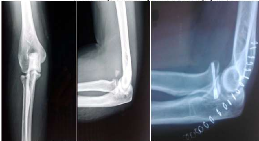
Type 2 radialhead fracture-pre op xray

CASE 2-39 year old male patient sustained injury due to RTA.