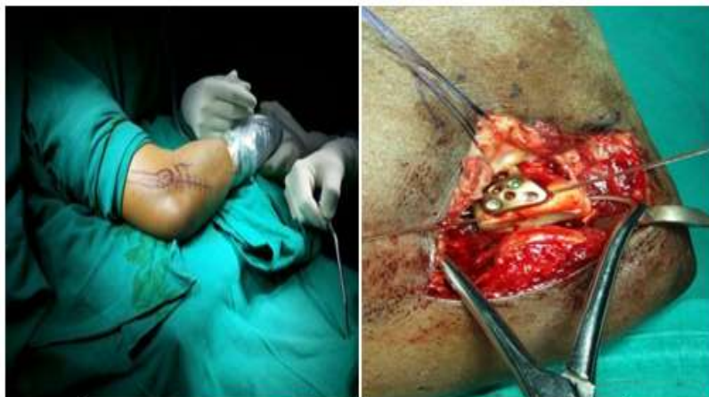
Intra-op picture showing plate placement in safezone.