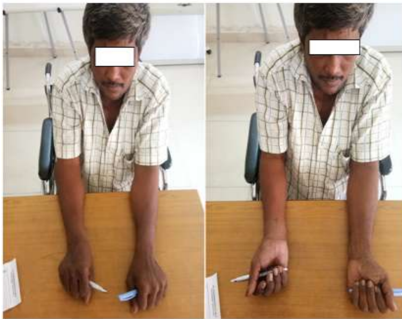
Elbow Rom At 6 Weeks Post Op