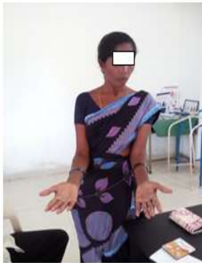
Left elbow ROM at 3 months postoperative period

CASE-4-39 yr old male patient sustained injury due to RTA