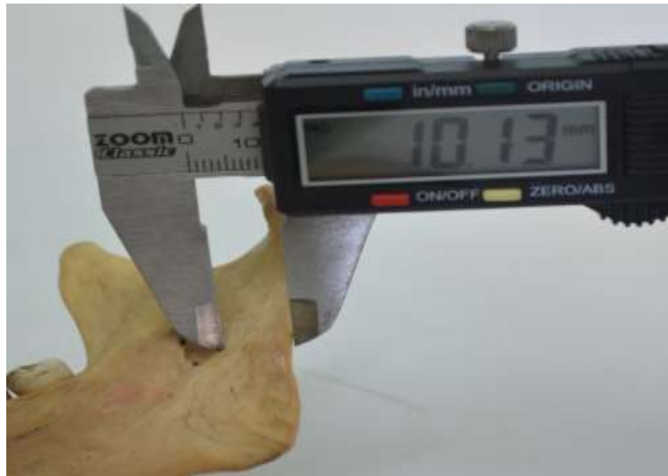
Figure 3. showing distance from Mandibular foramen to Posterior border. (MF-PB)