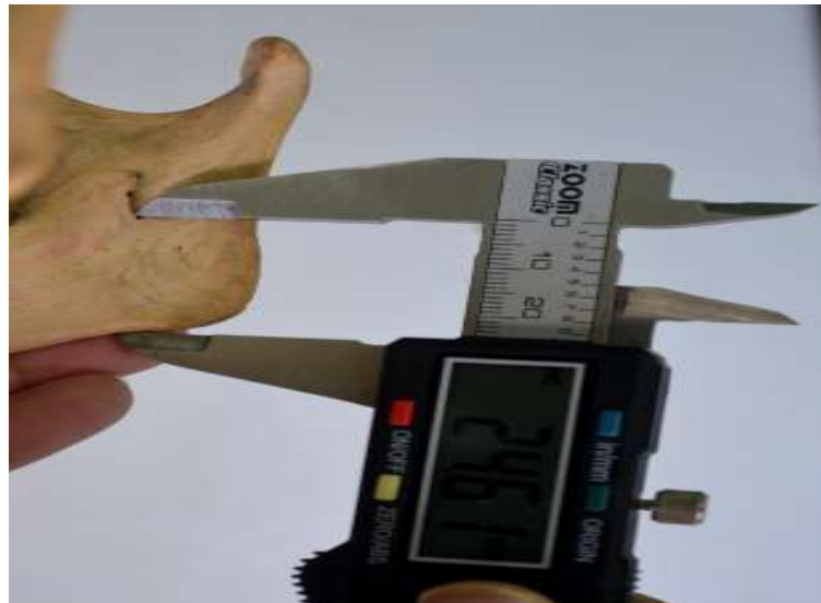
Figure 6. Showing distance from Mandibular Foramen to Mandibular Base. (MF - MB)