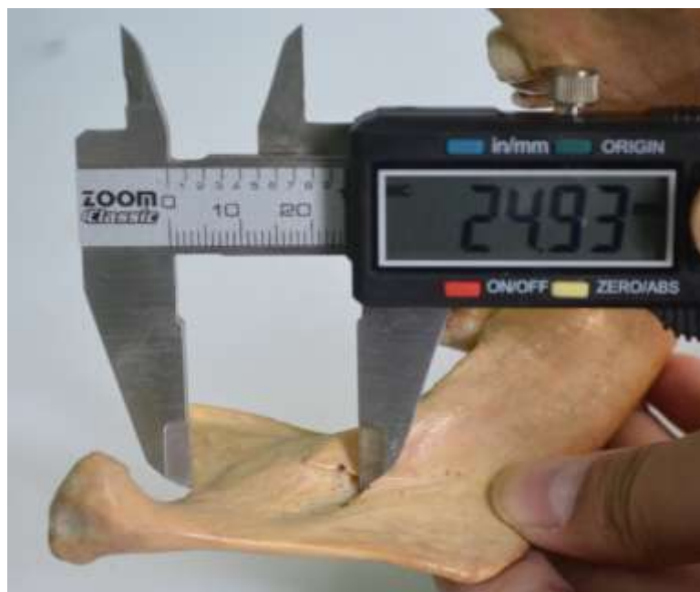
Figure 4. Showing Distance from Mandibular foramen to Mandibular Notch. (MF- MN)