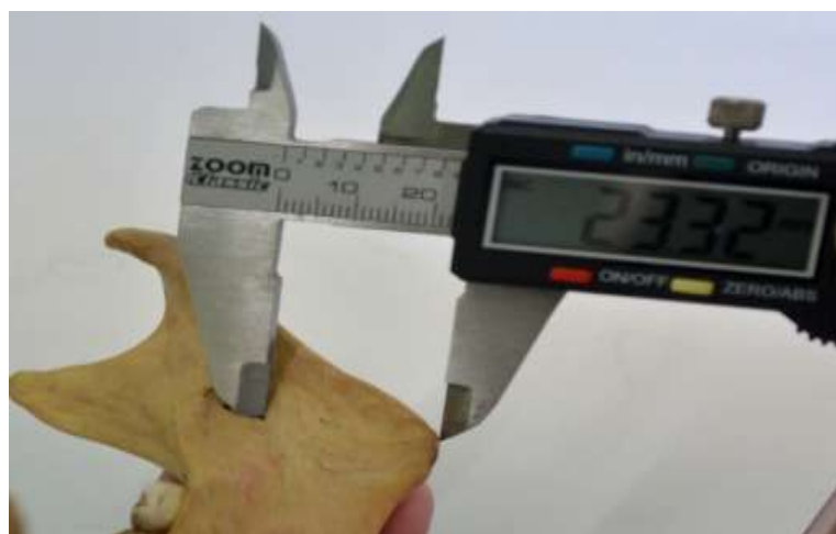
Figure 5. Showing distance from Mandibular foramen to angle of mandible.(MF - AG)