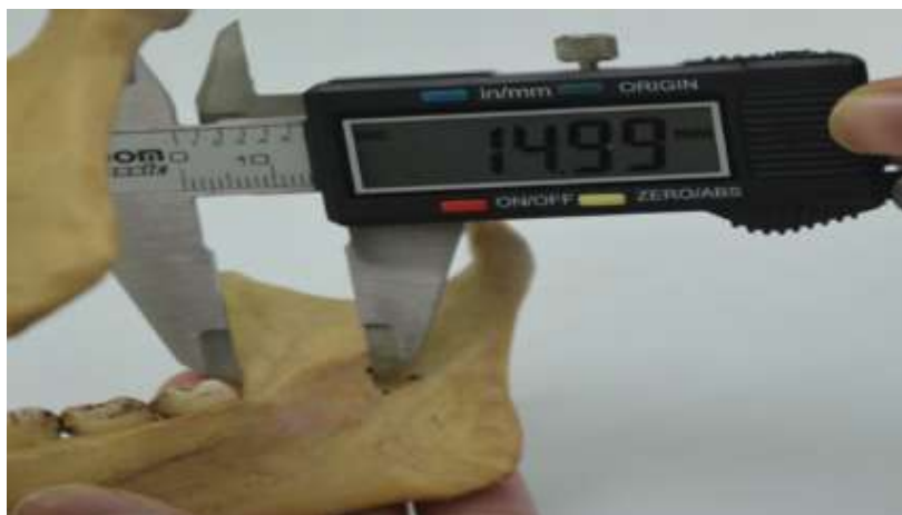
Figure 2. Showing distance from Mandibular foramen to Anterior border. (MF-AB)