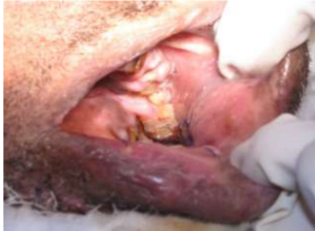
Fig. 2- Left dentoalveolar fracture

CT scan revealed hemosinus, bilateral maxillary sinus wall fracture, lateral pterygoid plate fracture, and nasal septal fracture( fig 3). CT shows a transversely running fracture line in the posterior third of hard palate(fig 4). No fracture was noticed in the mandibular arch. The patient's medical history revealed uncontrolled diabetes and a recent attack of myocardial infarction 2 months back. The patient was managed conservatively with crepe bandage, and intra venous antibiotics and analgesics. The patient was reviewed in one week's interval time for the first one month followed by 2 weeks in the subsequent months. There was uneventful healing of the posterior palatal fracture and the dentoalveolar segments. After a period of one year total extraction was carried out for the patient and prosthetic rehabilitation was done.