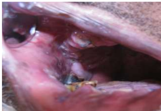
Fig. 1- Right dentoalveolar fracture

A 59-year-old male was involved in a motor vehicle accident and reported that he hit his lower jaw in the ground. He was brought to casualty complaining that he has severe pain in the throat region and feeling of nausea. The patient was fully awake conscious and he clinically presented with lacerated wound in the forehead, chin region and intra orally in the labial mucosa of lower lip. The patient was partially edentulous with chronic generalised periodontitis and multiple root stumps on the maxillary arch and mandibular arch. The lacerated wound was sutured using vicryl and nylon sutures. On examination bilateral dentoalveolar fracture including 16, 17, 18 and 27, 28 was found (fig 1 and 2). The bleeding was controlled and CT head and facial bone advised.