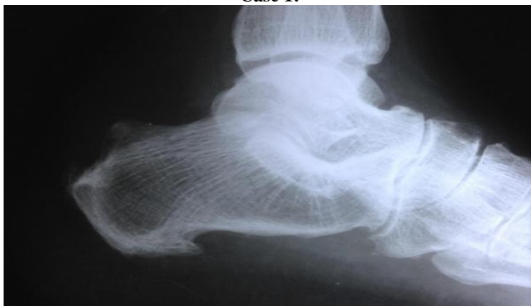
Figure 1.1: lateral radiograph of foot showing a calcaneal spur