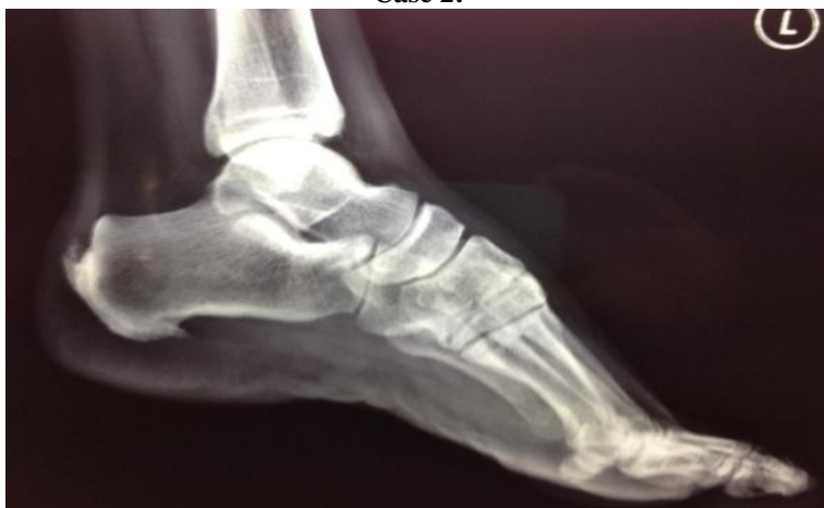
Figure 2.1: x ray left foot showing a calcaneal spur