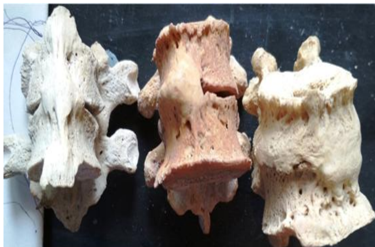
Fig 1a: Ossification of Anterior Longitudinal Ligament with bumps opposite the intervertebral disc