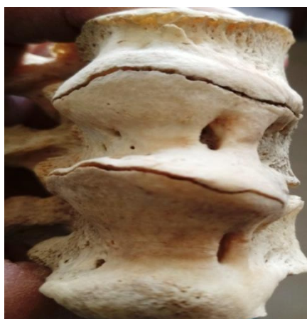
Fig.1b: Excessive ossification of ALL complicated with acute spinal fracture (chalk stick fracture )