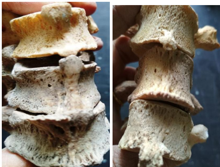
Fig 3: Upper thoracic vertebrae with small midline exostosis from upper (left fig.) and lower margins (right fig.)