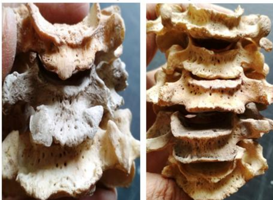
Fig 2: Cervical Vertebrae showing hyperostosis along the lower margin (in the left Fig) and both the margins (in the right Fig).