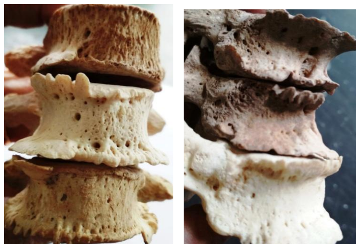
Fig 4: Lower thoracic vertebrae with hyperostosis along the right antero lateral surface, giving appearance of wax dripping from a candle.