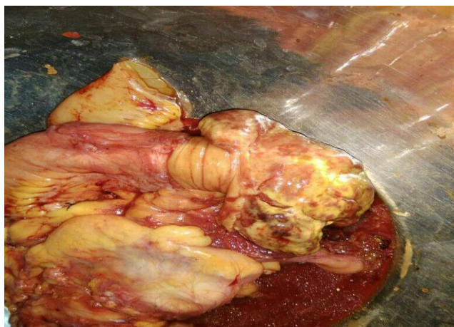
Figure 2 – Resected specimen