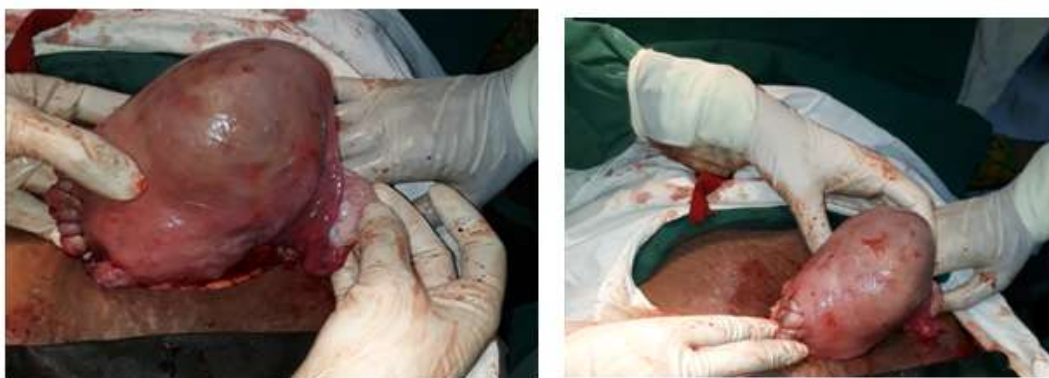
Figure 2 : Per-operative view of unicornuate uterus. Presence of single product.

She was induced with tab. Misoprostol per vaginally but there was failure of induction. She was taken up for caesarean section and intra-operatively she was incidentally found to have unicornuate uterus with no rudimentary horn and contralateral fallopian tube and ovary was absent (Figure 2). The baby cried immediately after birth, having birth weight - 3.2 kg with no gross congenital anomalies. She did not have any post-partum haemorrhage and the uterus was closed in one layer. Abdomen was closed in layers. She had an uneventful post-operative recovery and was discharged from the hospital on post-operative day 4.