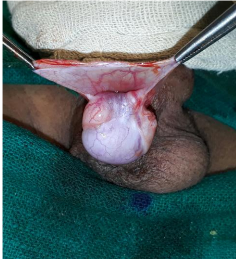
Picture 1 : exposing tunica vaginalis from Parietal layer of testis.