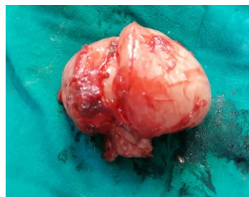
Fig 4; gross specimen of lesion showing glistening capsule