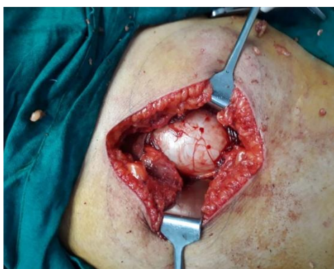
Fig3; intraoperative picture showing intra muscular lesion