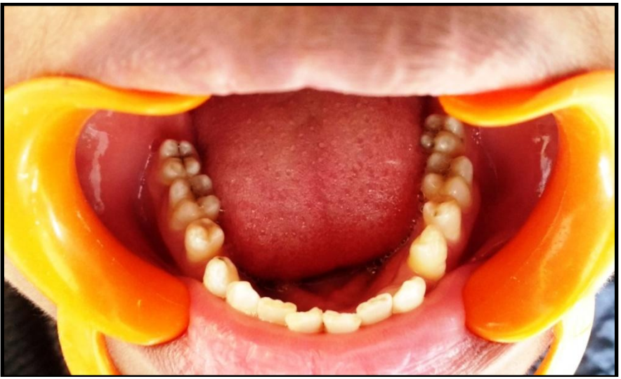
Figure 2→ Mandibular Arch

An Intra oral periapical radiograph was advised in relation to 26 to evaluate the deep caries status and an Orthopantomograph was advised to rule out the presence of any impacted supernumerary teeth.