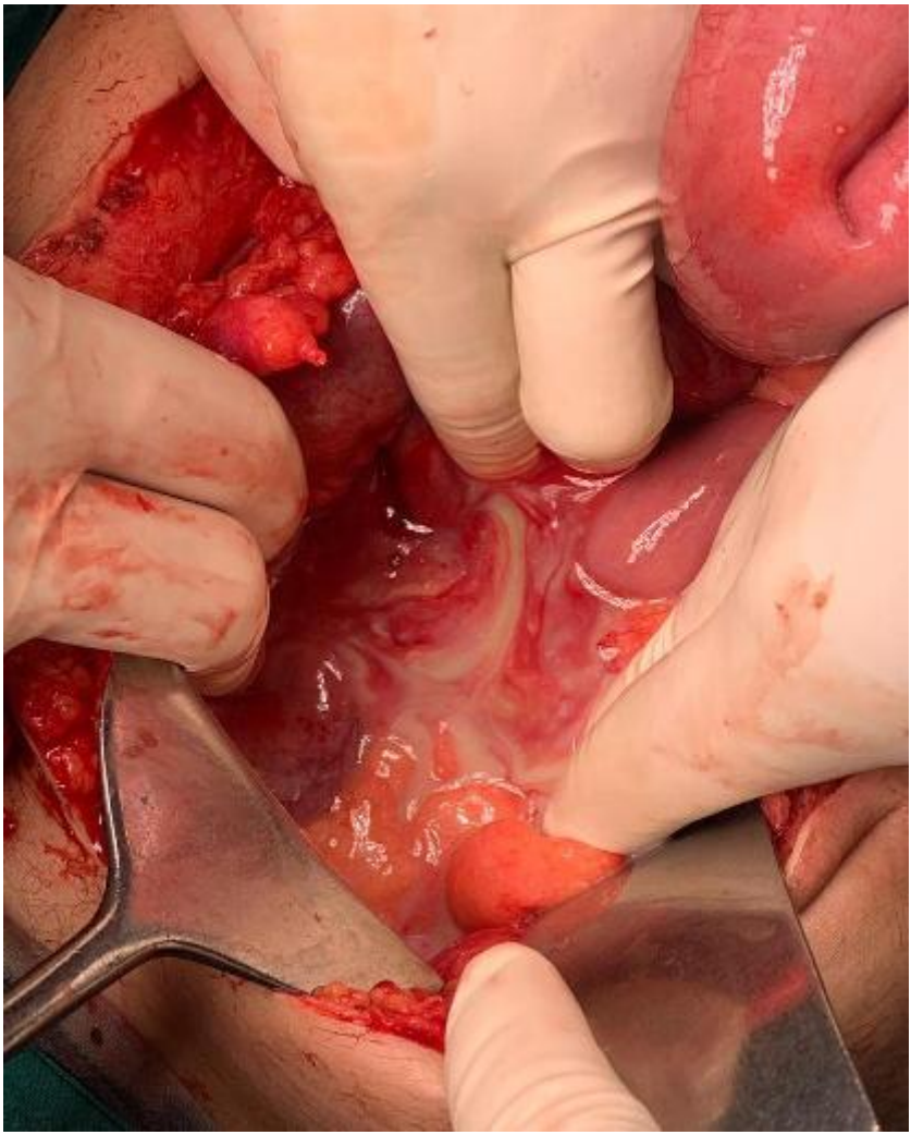
Pus in the right iliac fossa

Post-operatively the patient was managed with bowel rest, appropriate fluid, optimum analgesia and empirical antibiotics until the culture and sensitivity reports arrived. On post-operative day one, around 10ml of serosanguinous fluid was collected in the pelvic drain bag and sample was sent for culture and sensitivity test.Pus culture (collected intra-operatively) showed growth of Enterobacter sp. and appendix tip grew E. coli both sensitive to piperacillin + tazobactam, whereas drain fluid was sterile.