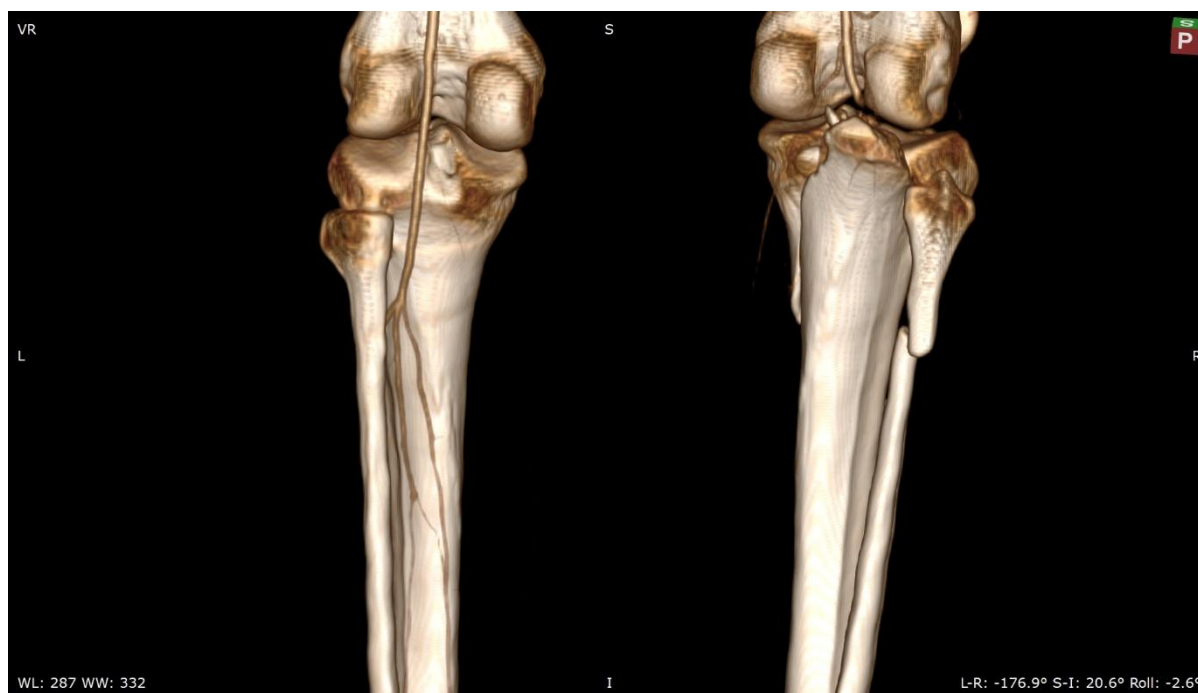
Figure 3: Volume rendered image shows the trifurcation, branching of ATA, PTA, and PRA is within a distance of 0.5 cm without formation of a true tibioperoneal trunk – type I B on left side and thrombosis of the distal popliteal artery with comminuted intra articular fracture of the tibial plateau and proximal fibular shaft on right side.