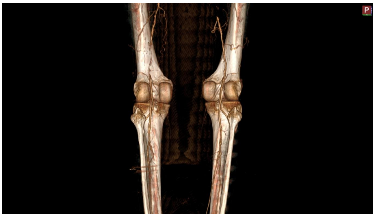
Figure 2: Volume rendered image shows the high branching pattern of the anterior tibial artery with medial course of the proximal portion of the anterior tibial artery on both sides- type II A2.