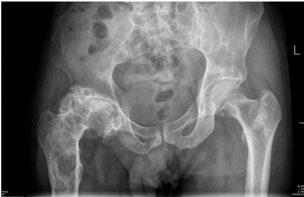
Fig. 1 An AP radiograph of the pelvis

Four days after admission, the patient underwent a surgery of right total hip arthroplasty.The procedure was performed under a general anesthetic condition. We carried out the posterolateral approach of the hip and the skin, subcutaneous tissue and iliotibial band were cut layer by layer. Then we exposed hip articular capsule and incise it along the neck of the femur after separated surrounding muscle groups and protect ischiatic nerve. Then femoral neck osteotomy was performed 1cm above the medial flat trochanter to remove the femoral head and part of the femoral neck and the 48mm diameter metal acetabular cup was selected to imbedding into acetabulum for the purpose of maintaining proper abduction and rake angle. Finally, the artificial prosthetic joint (provided by Zimmer) was imbedded after expanding and drilling the medullary cavity. And the plain radiographs after the right THA demonstrated the location and angle of artificial joint was fine. (Figure 3a and 3b). The patient had been maintaining a good quality of daily life during the half year's follow-up.