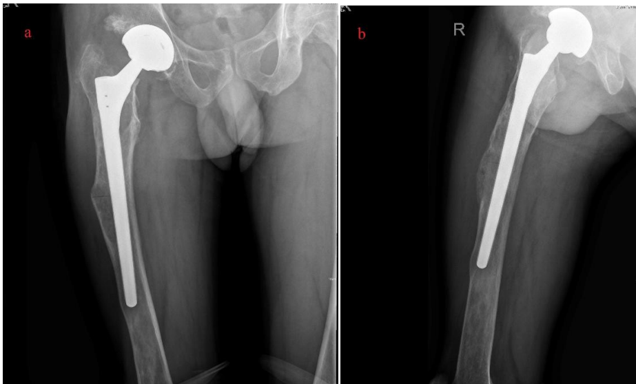
Fig. 3 Plain film after half years' follow up. (a) Plain film AP view. (b) Plain film lateralview.