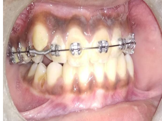
Figure : 8 ( Open coil spring in round stainless steel wire)

A premolar bracket was bonded on the palatal aspect of right first premolar .Ligature wire was passively attached from the bracket and tied to the molar tube to prevent mesial rotation of premolar (Figure: 9 )