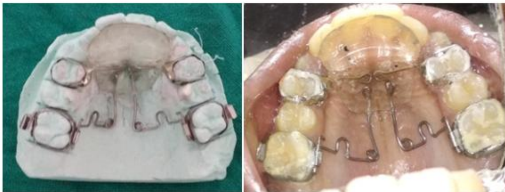
Figure 5: Pendulum appliance

Molar band with soldered buccal and palatal tube, a removable spring along with labially extended nance palatal button and premolar band, these were the two parts of the appliance used for the present case(Figure:5). In the third visit, the right & left maxillary molars were banded and bonded. The fabricated pendulum appliance was taken into the oral cavity, premolar band was cemented on the first premolar just before the posterior portion of the appliance inserted into the molar tube soldered into the banded maxillary molars.