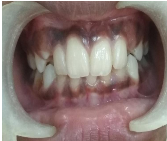
Figure :2 Intra oral Frontal view