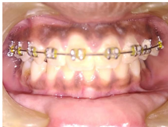
Figure: 10 (Final alignment with round SS wire)

One month later, on recall visit sufficient space was created for the erupting 13. Round wire and open coil spring was removed , a bracket was attached on the labial surface of 13.The 0.014 Ni Ti wire has been placed for the alignment of 13.Patient was recalled after I month on examination it has been aligned to the correct occlusal level. The 0.014 Ni Ti wire was replaced with round 0.014 and subsequently,0.018 SS wire.