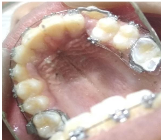
Figure: 9 Palatal view of space creation on right canine region

A premolar bracket was bonded on the palatal aspect of right first premolar .Ligature wire was passively attached from the bracket and tied to the molar tube to prevent mesial rotation of premolar (Figure: 9 )