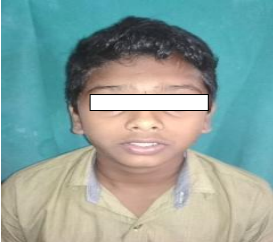
Figure: 1 Extra oral Frontal view