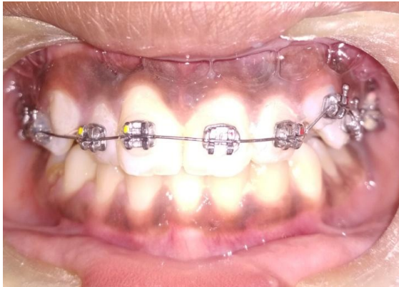
Figure: 7 (0.014 Ni Ti )

During the second stage pendulum appliance was removed. Brackets were placed on the etched & bonded tooth surface except for right maxillary canine. Initially, 0.014 Ni Ti was placed for the tooth alignment 1 month later all teeth has been aligned properly (Figure:7). Later, round stainless steel wire placed along with open coil spring (Figure:8).