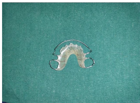
Figure 11: Retainer