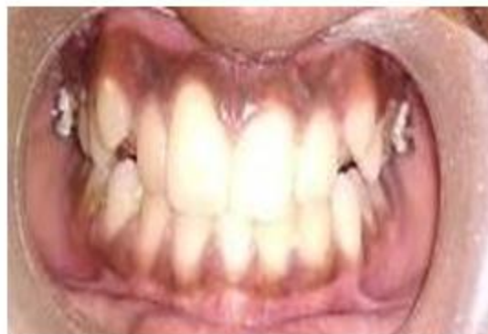
Figure: 6 (Frontal view at 4 month)

The patient was recalled every 3 weeks to activate the helices. At the end of 4th month sufficient space was regained and the left maxillary canine was started to erupt into the space gained (Figure:6). The right maxillary canine has been started to erupt labially, which shows 3mm space deficiency. In order to overcome this problem, we have planned a second stage treatment for space creation in the right maxillary canine region and their subsequent alignment all around the dental arch.