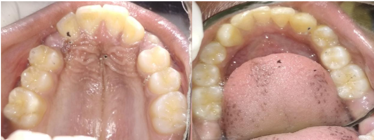
Figure:3 intra oral view(maxillary & mandibular arch)