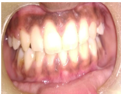
Figure 10: post operative view

Instructed the patient to revisit every 3 weeks interval to check the integrity of brackets and to measure the oral hygiene. On 12 th recall visits, all teeth were in good alignment, deep bite was corrected. Brackets, arch wire and molar tubes were removed, scaling was done and an upper impression was made for retainer. Patient was recalled after 3 days for the insertion of retainer (Figure: 11).