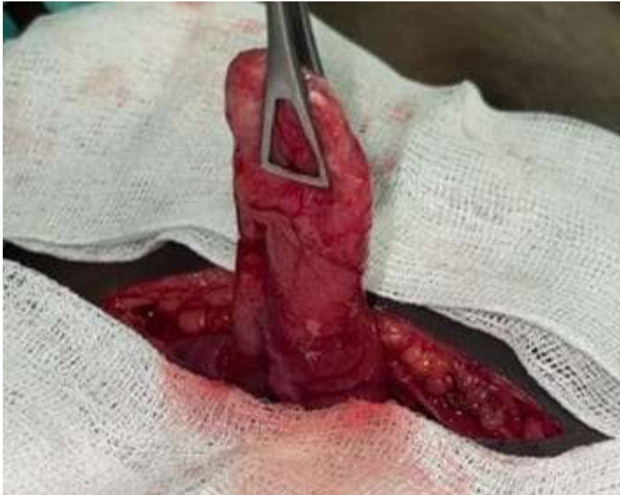
Figure 5: Intraoperative image of the phlegmonous appendix