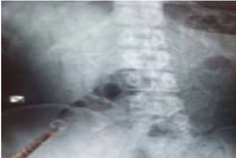
Figure 2: X-ray image showing stercolitis.