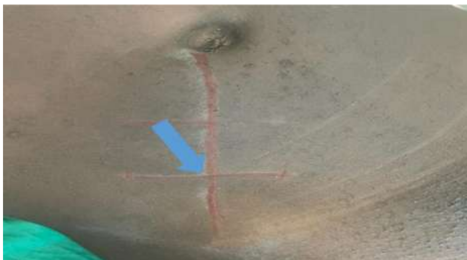
Figure 4: image showing Mac Burney approach