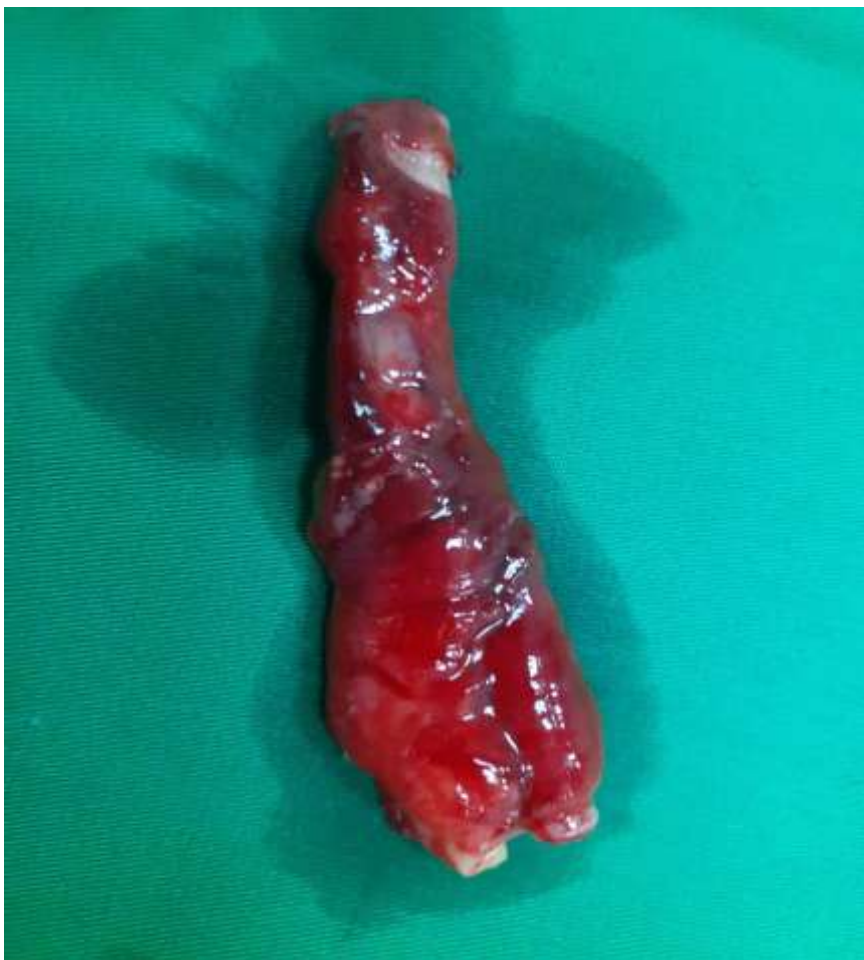
Figure 6: image showing appendectomy specimen