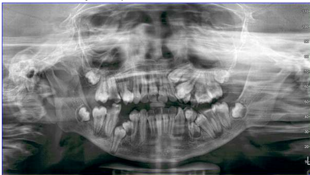
Figure 6: Orthopantomogram showing multiple impacted permanent teeth, multiple impacted supernumerary teeth and taurodontism of all molars.

The IQ assessment revealed mild intellectual disability of IQ 65 with patient's basal age being 6 years and terminal age of 14 years. The ophthalmic examination revealed myopia and horizontal nystagmus. Doppler ECHO revealed dilated right atrium and right ventricle, moderate tricuspid regurgitation, Pulmonary hypertension, Supraclavicular mild pulmonary stenosis, moderate Pulmonary regurgitation, IAS septal aneurysm. Based on the reports of investigations, it was finally diagnosed as Noonan syndrome.