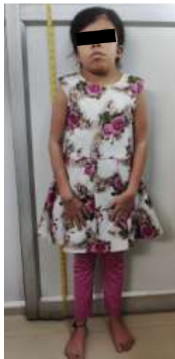
Figure 1: Short stature of the patient