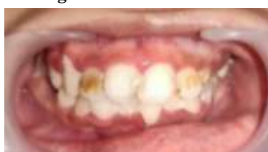
Figure 4: Intraoral view

Intraoral examination revealed permanent dentition with poor oral hygiene and generalised gingival inflammation was evident (figure 4). The dentition showed crowding in both maxillary and mandibular arches with characteristic high arched palate. Many permanent teeth were unerupted (23,25,35,45) with multiple retained deciduous teeth (63,65). Multiple carious teeth (16,65,36,46) were evident.(figure 5a & 5b)