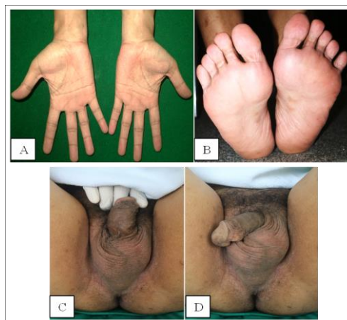
Figure 2. 6th-month follow-up. (A-D). No new lesions were found and the old lesions had disappeared leaving multiple hyperpigmented patches on the bilateral plantar pedis and scrotum.

The treatment given to the patient was a single intramuscular injection of benzathine penicillin G 2.4 million IU. After administering the injection, there were no allergic reactions, fever, or Jarisch-Herxheimer reactions. Follow-up was carried out at months 1, 3 and 6. The results of re-examination of VDRL in the 1st month after treatment were 1:128 and in the 6th month were 1:64. Improvement in the lesions began to appear in the 2nd week after therapy and no new lesions were found ( Figure 2 ).