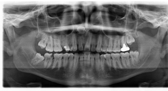
Figure 2: Panoramic radiograph revealed an opacity above the root of 12