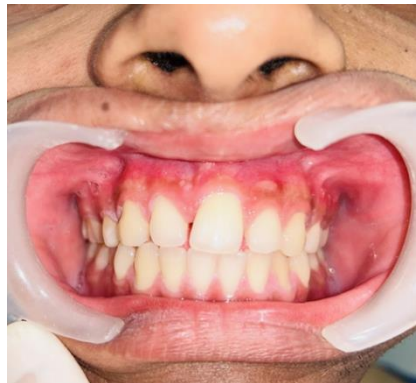
Figure 1: Missing permanent right central incisor

Clinical follow up was done at 1 week and 1 month. There was no evidence of any complications and patient reports symptomatic improvement.