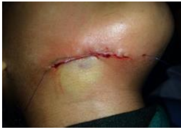
Figure-6 Sub-Cuticular Sutures