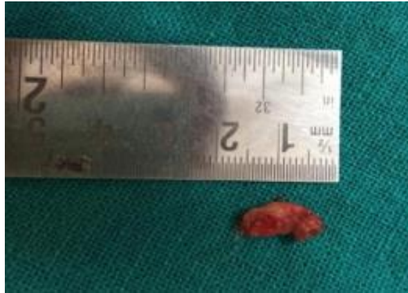
Figure- 5- Dimension Of Specimen Sinus Tract Fragment.