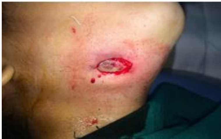
Figure-3 :- Under Local Anesthesia, Primary Full Thickness Incision Was Made.