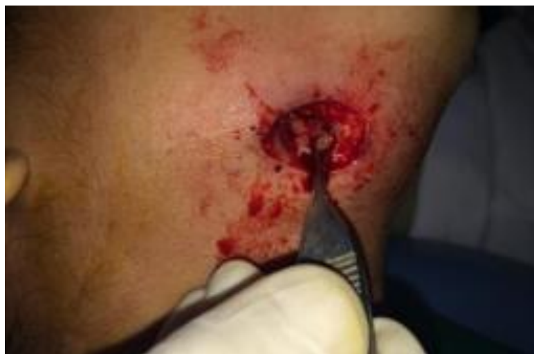
Figure 4- Surgical Excision Of Sinus Tract.