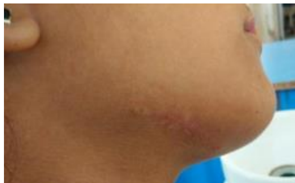
Figure-8 :- After 3 Months Of Follow Up, The Cutaneous Lesion Had Healed Completely With Neat Linear Scar Formation.