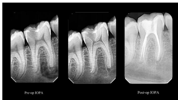
Figure-7 Pre And Post Operative Radiographic View Of Successful Intervention With The Help Of Endodontical With Surgical Procedures.