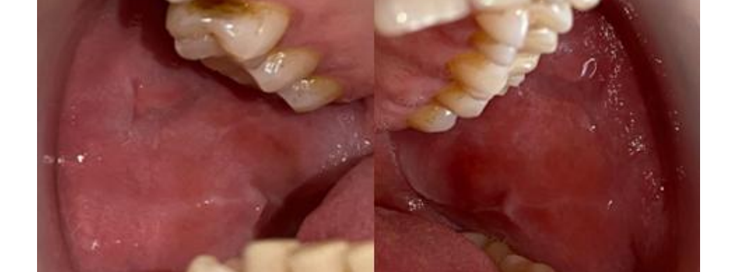
Fig.3(A): Rt. Buccal Mucosa

Arrow Showing Acanthosis Of Spinous Layer. Fig.3 (A) & (B) Post Treatment