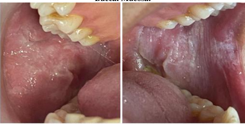
Fig.1(A)&(B) Showing Symmetrical Irregular, Well-Defined Borders.White Plaques And Patches On The Buccal Mucosa.

Fig.1(A): Right Buccal Mucosa Fig.(B): Left Buccal Mucosa