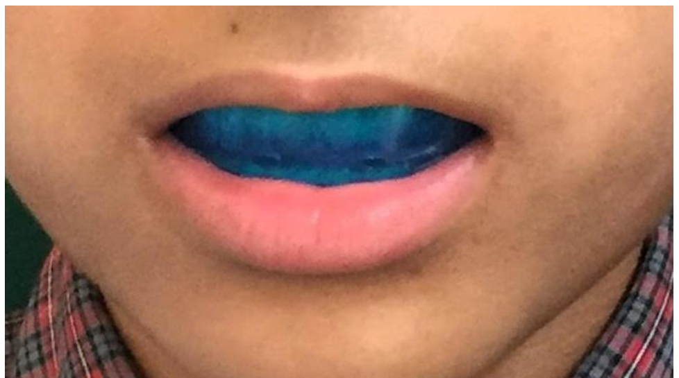
Figure 4 – Subject wearing a prefabricated orthodontic trainer appliance T4K-First Phase for habit interception