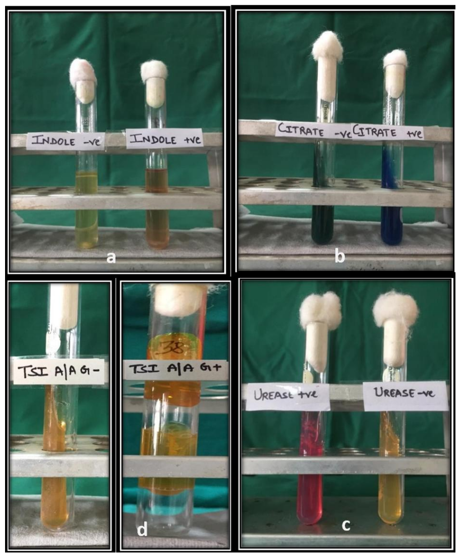
Figure 2 a-2d - Confirmatory biochemical tests - indole, citrate, urease, and TSI (Triple Sugar Iron) agar test