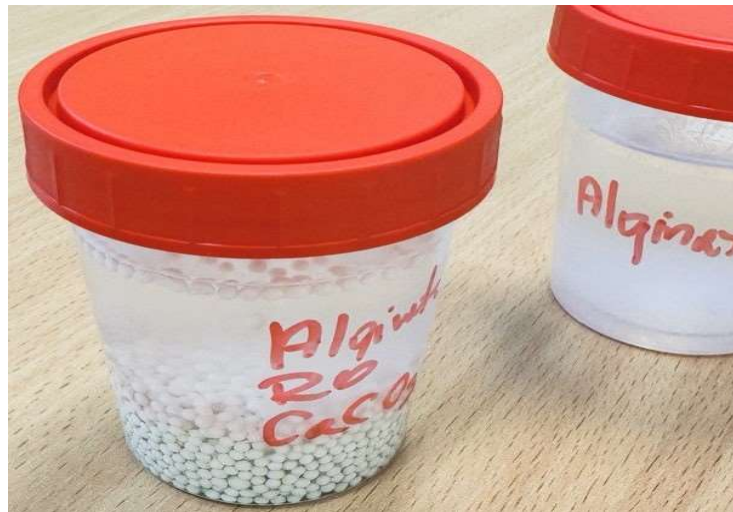
Figure 1. Healing agent for concrete with micro-balls of sodium alginate (by author Isaac Odiri Agbmu)