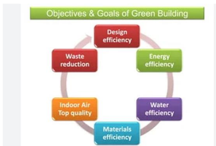
Figure 2 : Objectives Of Green Building Technologies