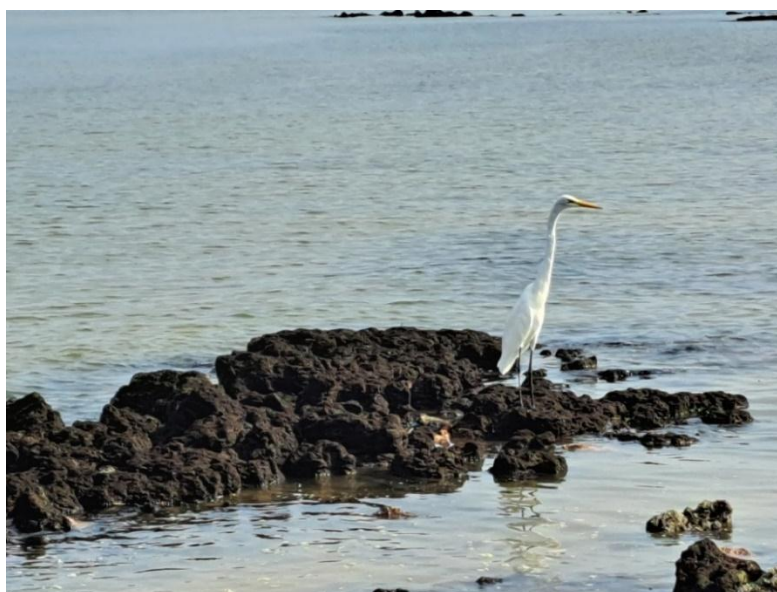
Murumbira beach with low tide with an emphasis on Ardea alba .

Several species of fauna were observed during the collection of water samples, among which stand out: Anableps anables , Macrobrachium amazonicum , Egretta thula , Ardea alba , Vanellus chilensis (Molina, 1782), Falco peregrinus , Crotophaga ani , Portunus spinimanus , Armases benedicti (Rathbun, 1897), Ucides cordatus cordatus , Pitangus sulphuratus , Brachyplatystoma filamentosum , Cichla spp. among others.