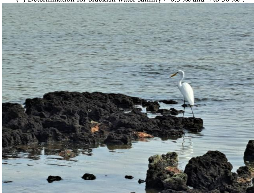
Murumbira beach with low tide with an emphasis on Ardea alba .

(*) Determination for brackish water salinity > 0.5 ‰ and ≤ to 30 ‰ 5 .