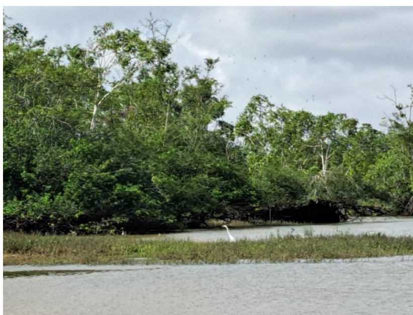
Carananduba Beach with low tide with an emphasis on Ardea alba .

(*) Determination for brackish water salinity > 0.5 ‰ and ≤ to 30 ‰ 5 .