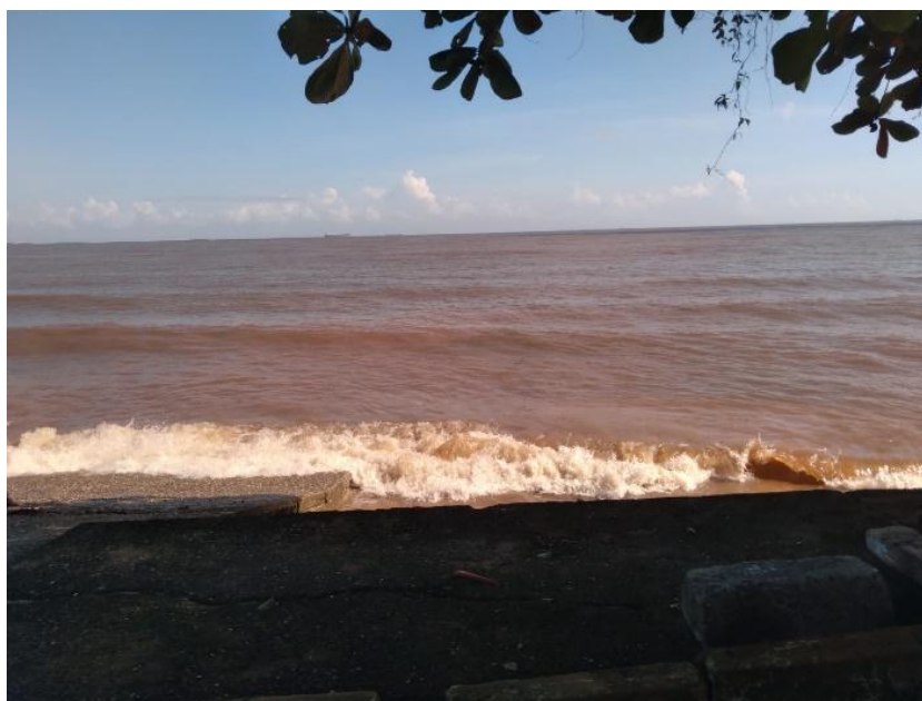
Murubira Beach at high tide, reaching the protection wall, with emphasis on the ferruginous color of the water at that moment.

composed of the iron element, which may have been identified in the samples due to the presence of heavy rains that occurred during the period, causing possible leaching of the soil and these ferruginous rocks.