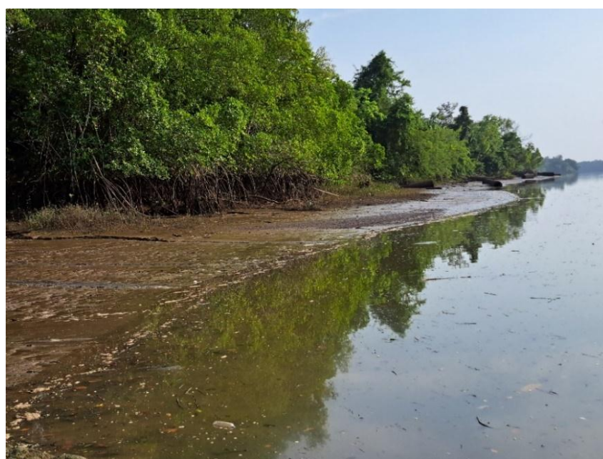
“Furo das Marinhas” on the edge of Mosqueiro Island, with emphasis on the mangrove forest.

(*) Determination for brackish water salinity > 0.5 ‰ and ≤ to 30 ‰ 5 .