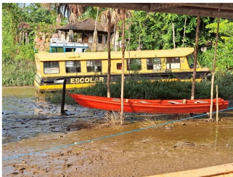
School transport boat and canoe for fishing and transport anchored at "Furo das Marinhas".

It is worth mentioning that waterway traffic of cargo ships was identified in the Northwest part of the island of Mosqueiro in Murubira beach and West in Carananduba beach; In “Furo das Marinhas”, in the East part of the island, only small boats were observed used for fishing crab, shrimp and fish, as well as school transport, connecting with land transport, for riverside students. Navigation activities must be monitored and guided regarding pollution risks.