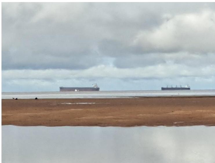
Cargo ships in constant transit in front of Carananduba beach.

Lotic systems are affected by the following modifications: pumping water for irrigation of public or private supply (farms), which alters the flow and structure of rivers; organic and inorganic pollution from industrial and agricultural sources (point and diffuse sources). Pesticides, herbicides, heavy metals and discharge of untreated sewage are some of the threats to the integrity of rivers; intensive land use, which leads to an increase in suspended material and the discharge of substances and elements in large quantities into lotic systems; introduction of exotic species, which alter the food web and the natural process of community interaction; removal of riparian vegetation, which is extremely important in maintaining buffer conditions for rivers. This removal, in addition to reducing the organic matter available to fish and invertebrates, no longer protects the banks and slopes of rivers, altering their morphometry; construction of dams for hydroelectricity and public supply; alteration of floodplains and flooded areas associated with dams for agriculture, construction of canals or urbanisation; bridges and passages, which interferes with the functioning of rivers, alters the substrate (physical and chemical compositions) and removes and affects organisms; construction of large areas for irrigation, with considerable withdrawals of water for this activity, contamination by domestic (sewage) and industrial waste, are the two biggest threats to lotic systems 2 .