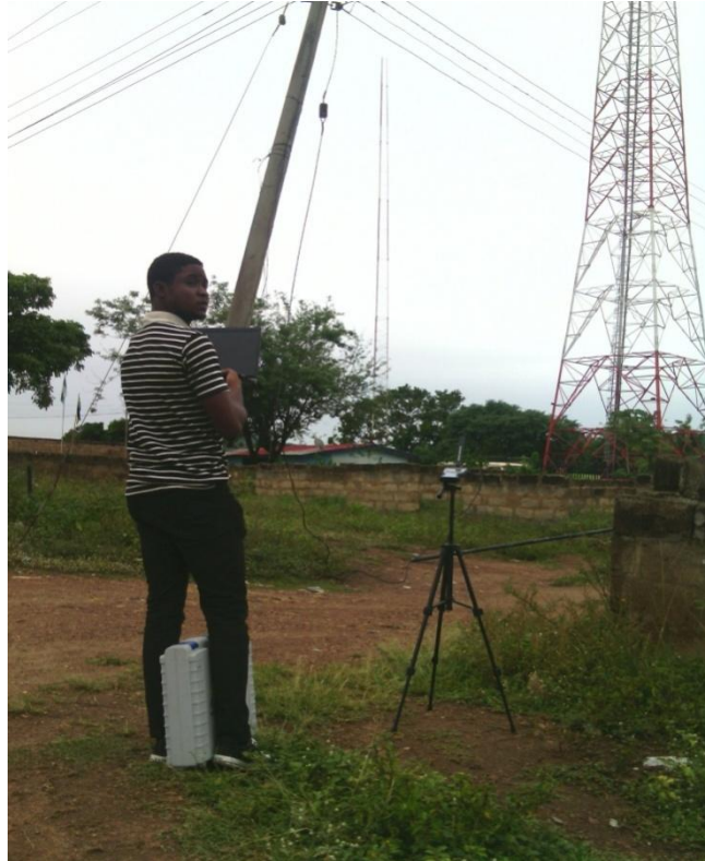
Figure 1 Set-up of the spectrum analyzer on field