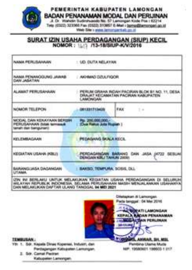
Gambar 7. Company's permit certificate (SIUP)