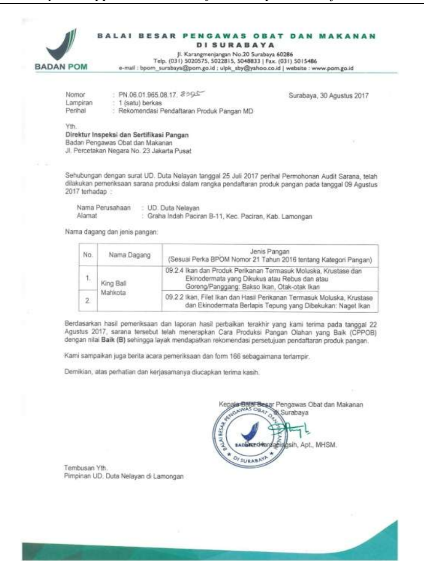
Figure 8. Circulation eligibility certificate-BPOM at phase 1