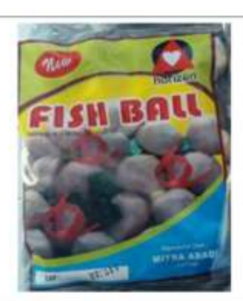
Figure 6. Fishball products of SME before and after certification