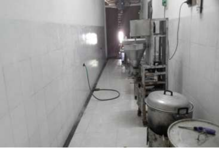
Figure 3. Production unit entrance