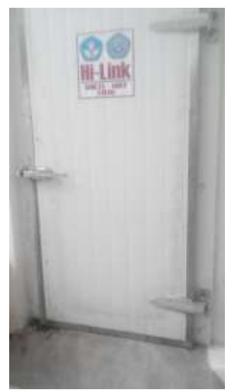
Figure 5. Mini coldstorage door

This layout renovation enables to promote the implementation of cold chain system in the processing from the raw material acceptance to the frozen storage. The raw materials came using ice cube cooling, and these were immediately processed with more ice cubes to maintain the fish temperature. The fish meat milling was also mixed with ice cubes, and to keep the eveness of the batter formulation, the ice cubes were weighed. After the products had been packed, these were in the ante room for 2 hours, them moved to the mini coldstorage of air blast freezer as shown in Fig. 5. The fishball products of Duta Nelayan are shown in Fig. 6.