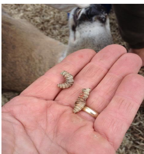
Figure 2. Larvae collected in paranasal sinuses.