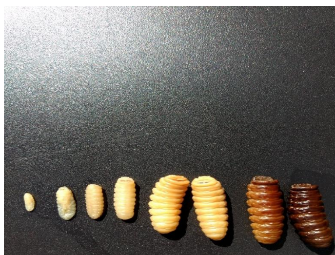
Figure 3. Larval stages L1, L2, and L3.