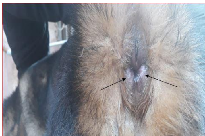
Fig 3: Small bulging gland like mass located at the left and right side of the anus