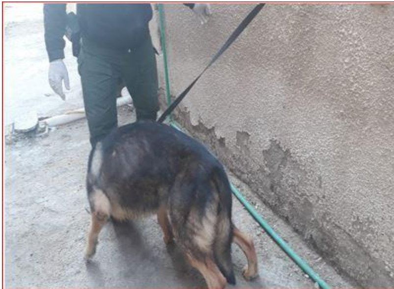
Fig 1: Straining with difficult defecation

Anal sac disease or Hemorrhoids were suspected, As, the disease dog show signs of discomfort, especially when forced to set down, straining with difficult defecation Fig 1. The animal drags his butts upward or arch its back .Fig.2 , bad odors or scents comes from its anal area , animal tries to lick its anus sometimes, Moreover on rectal examination by a finger small bulging gland like mass located at the left and right side of the anus was detected and could be seen even from outside, Fig.3. Furthermore, the vital signs of the diseased dog show, body temperature (38.4C), the heart rate was 110/ min, respiratory rate of 33/ mint. Table 1. In addition, examination of blood parameters indicates a slight increase of PCV value. Table 2.