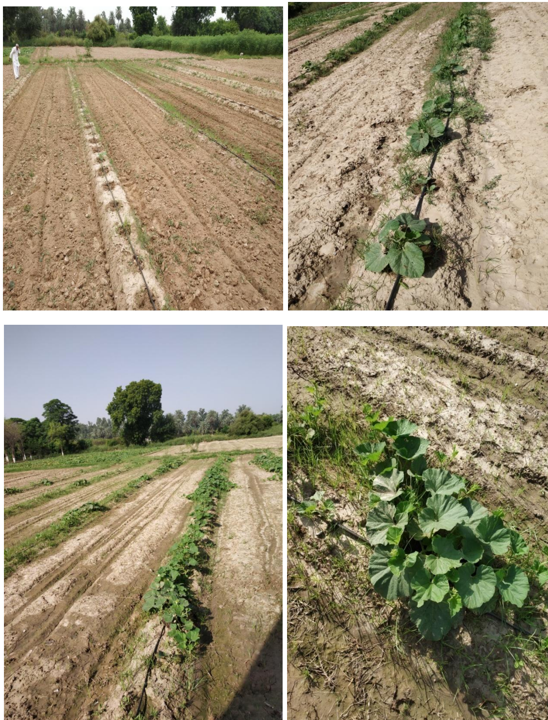
Fig. 2: Bottle gourd grown using solar operated drip irrigation system (Anonymous, 2019b)