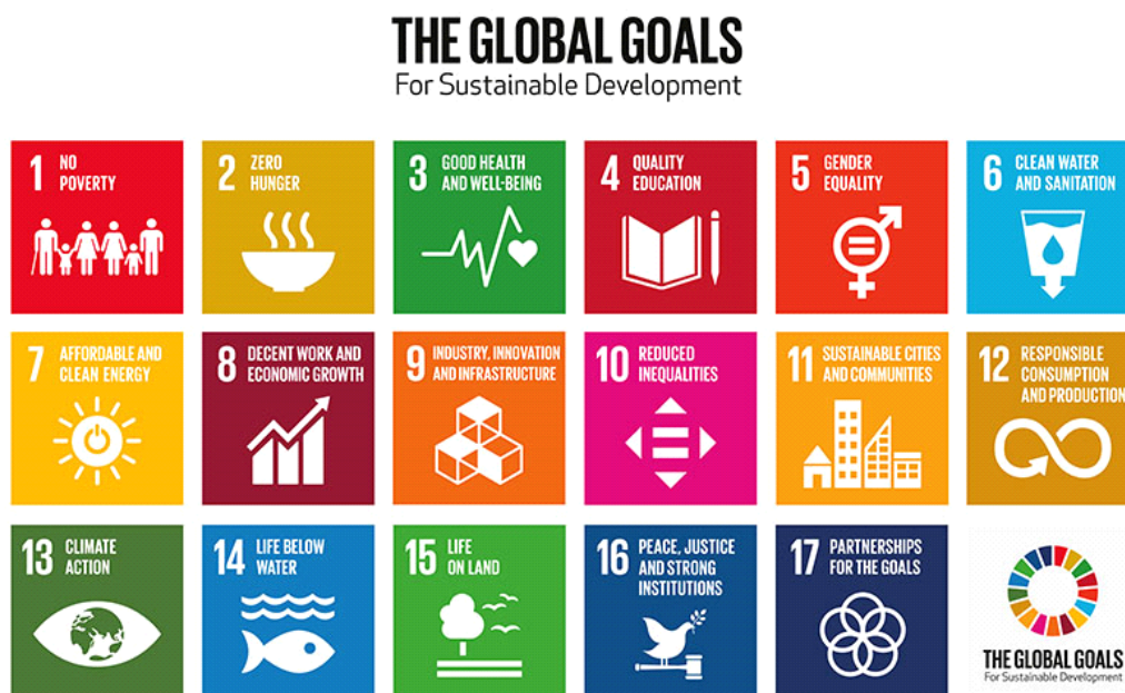
Figure 12. Sustainable Development Goals to which agricultural robotics can contribute (1,2,8,9,12,15).