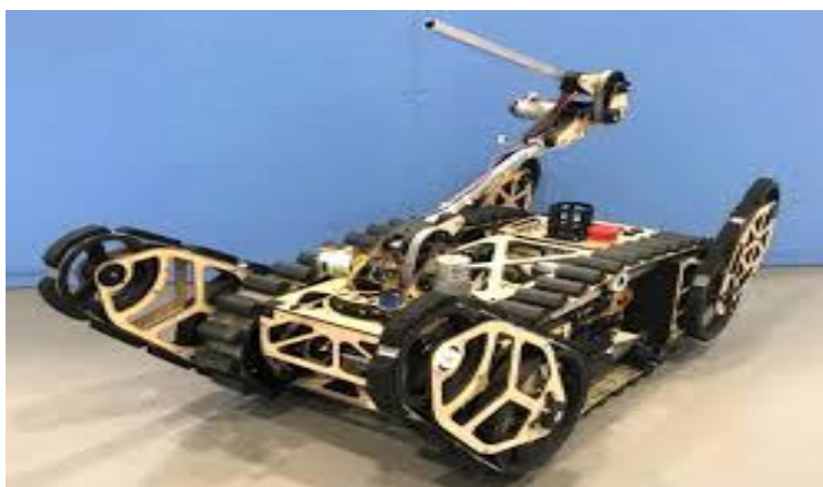
Cambridge University Robot

While a scalable commercial lettuce harvester remains elusive, efforts to produce one have ramped up. In 2017, for example, John Deere acquired CV agtech trailblazer Blue River Technology, which has made notable strides in lettuce-focused robotics.