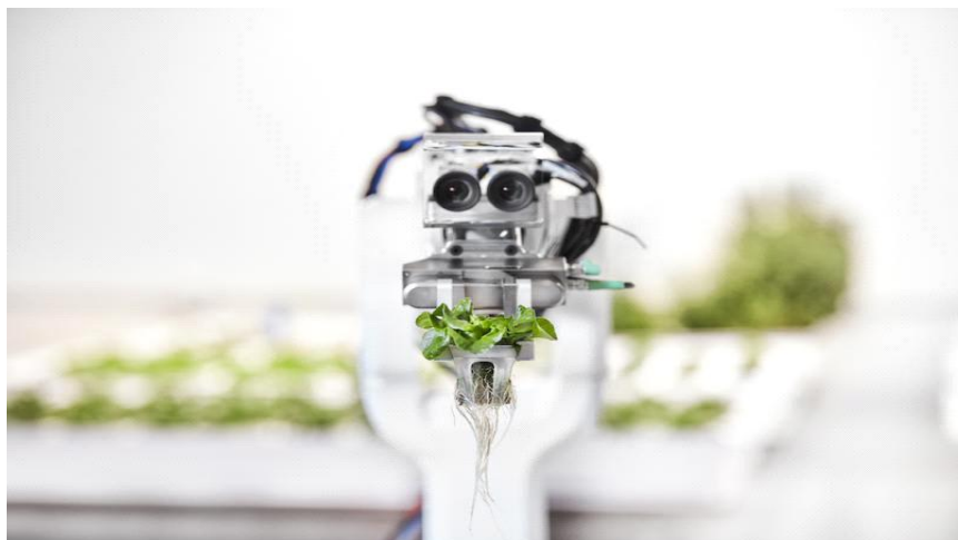
Robotic Greenhouses & Robot Farming

Below are two well-financed coastal startups —one West, one East — that are helping, um, plant the seed for a robotic-greenhouse future. Not everything is growable in this way, but for certain crops the improvements are striking. Both of these companies promise a dramatic decrease in the amount of water used (between 90 and 95 percent less) for an equivalent crop yield, and both boasts controlled indoor environments that eliminate the need for pesticides. Here's how they do it.