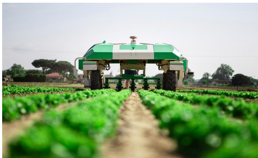
Naio Technology Robot

Electric and shaped like an inverted U, the long-running Ted simultaneously rolls over and around a vine row, using RTK satellite navigation to stay on course. (A drone maps out the initial plot of land that Ted surveys.) Industry-standard blades and finger weeders run along the base, pulling unwanted weeds from the vines and consequently decreasing the need for herbicides. Ted's robotic cousins include weeding robot Oz and vegetable robot Dino.