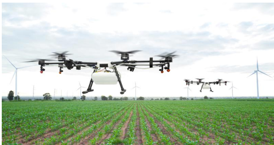
Aerial Imagery and Seed Planting Drones

But they're out there, if not yet in large numbers. Here are some companies that prove there's something's in the air when it comes to agricultural imaging, seed planting, and cloud seeding.