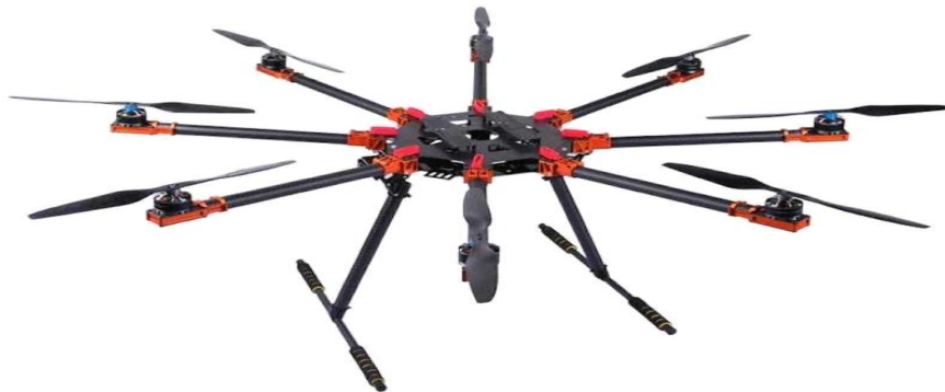
UAV Systems International

limit, according to the company. UAV also markets crop sprayer drones and surveillance drones that inspect crop health.