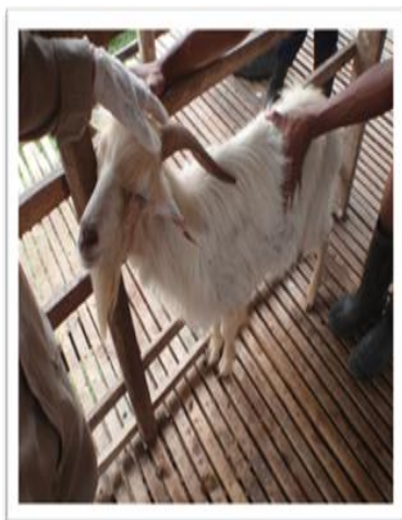
Fig. 1: Shows goat with rough hair coat.