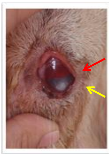
Fig. 2: Shows reddening of the conjunctiva (red arrow) and a corneal ulcer (yellow arrow) in the left eye.