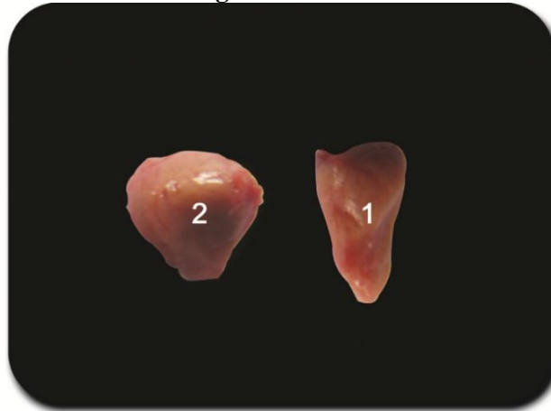
Fig. 1. Adrenal glands (6 weeks)

1. Left adrenal gland 2. Right adrenal gland