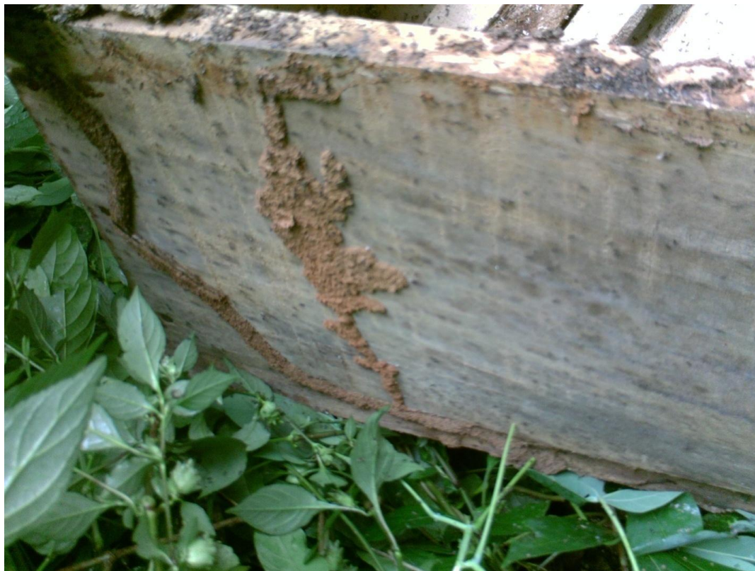
Fig. 2: Hive completely attacked by two species of termites

The activities of CN pests did not show any negative impacts on the wooden hive and probably on the colonization rate unlike CD insect pests. The CD insects; especially small black ants' appearance were annoying and their activities have excreta-like staining impact on the wood while the termites were both wood destructive and had soil staining impact on the wood.