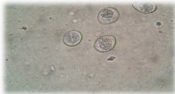
Plate 1: Microscopic Photograph showing Coccidia oocysts egg. x400

Note: += Light infection, += Moderate infection, +++= Heavy infection, -= Nil.