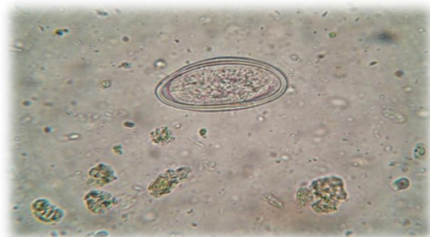
Plate 2: Microscopic Photograph showing Enterobius egg. x400