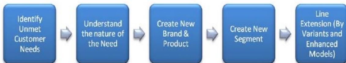
Figure 3. Tata Motors Corporation Marketing Philosophy