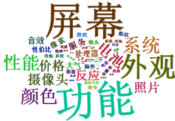
Figure 2: Wordcloud of product features

Then, all mined product features are listed in table 2, and the ID is the code of product feature which will be used in the IPA to simplify. Besides, the value of sentiment and frequency have been standardized to keep the result simple.