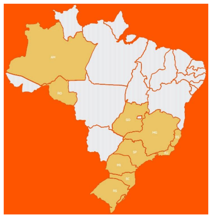
Figure 8 Cresol System: Brazilian territorial coverage.