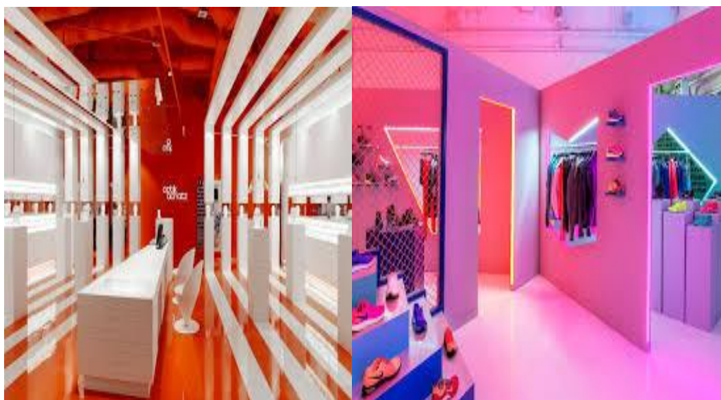
Figure Error! No text of specified style in document..1 Store Colour

Colour is one of the most important tools in the Visual Merchandising. Colour increases the brand recognition up to 80 percent. Colour has an impact on human psyche and it has ability to affect our mood. Primary colours like yellow, blue, red are always attractive. Colours are mostly associated with occasions and emotions (Young & Lee, 2013). Colour has the ability to attract more customers into the store. Attractive and elegant colour in the display items turn walkers to stoppers and significantly convert them into shoppers. Texture can be rough, smooth, sleek, durable, permanent, thick, thin, earthy, natural, wholesome, sandy, soft, hard, coarse, fine, regular or irregular (Soundhariya & Sathyan, 2015).