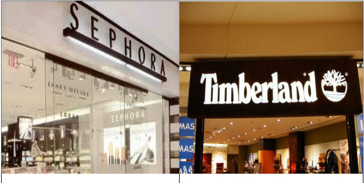
Figure Error! No text of specified style in document..2: Signage