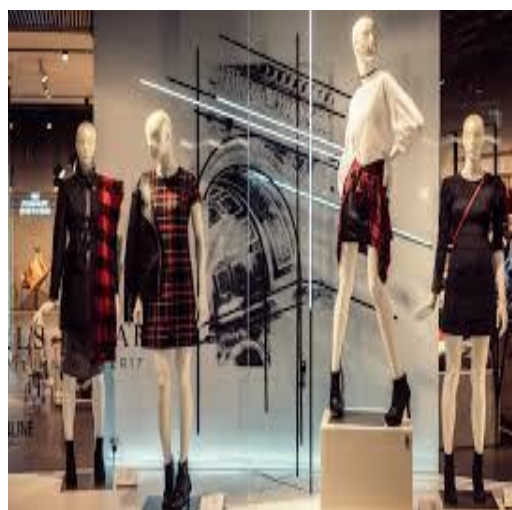
Figure Error! No text of specified style in document.. Window Display