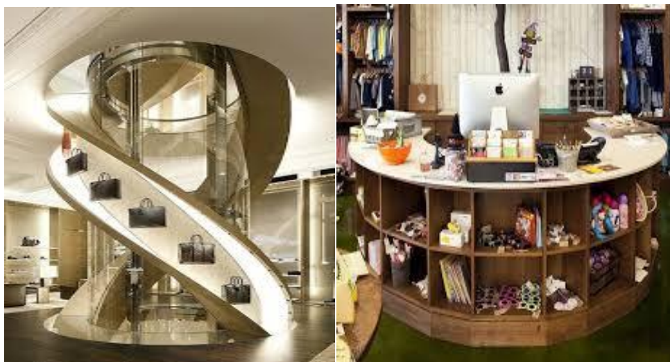
Figure 1: Store Layout