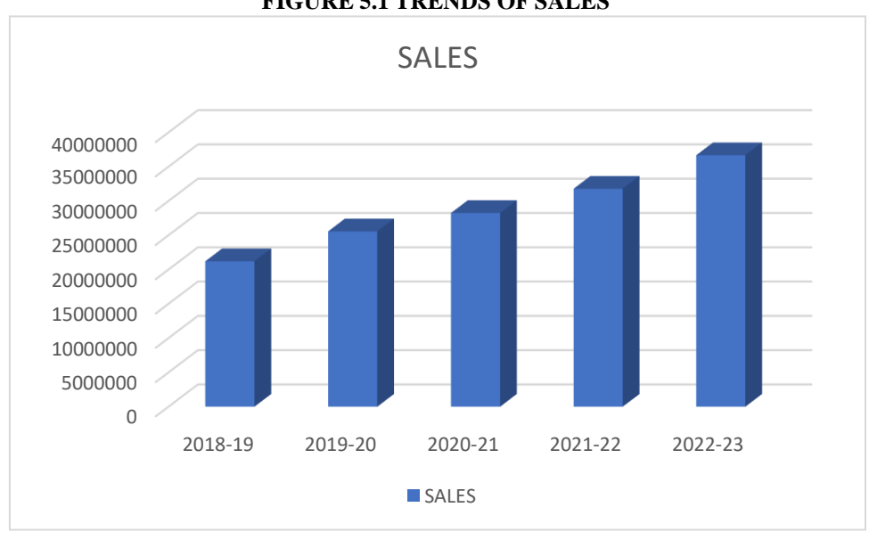
FIGURE 5.1 TRENDS OF SALES