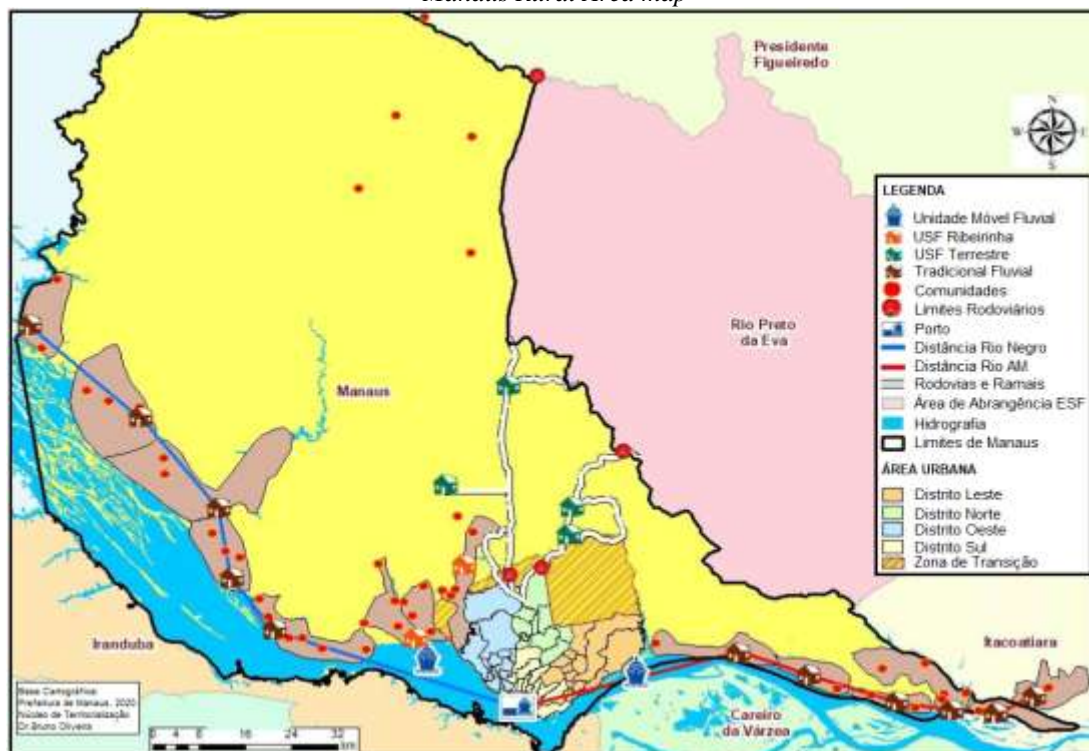
Image 1 Manaus Rural Area map

Note: Adapted from Manaus City Health Plan, 2022-2025.